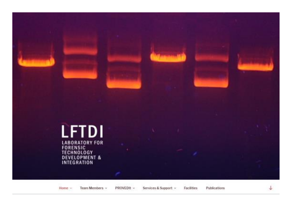
Laboratory for Forensic Technology Development & Integration <u>Website</u>

prototype. In 2014, the team received a DOD Rapid Innovation Fund award to improve the models and advance the prototype. Along with producing NOCIt, the team made all mixture data available to the forensic community via the Project Research Openness for Validation with Empirical Data (PROVEDIt) database. PROVEDIt has been used in 19 distinct studies, including the National Institute of Standards and Technology's MIX13 study and STRMix's Collaborative Exercise on DNA Mixture Interpretation.