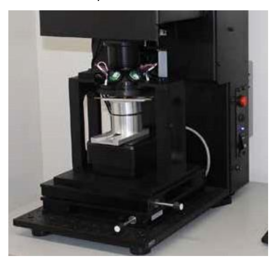
\label{thm:condition} Top Match-GS 3D \ Version \ 2 \ Scanner: example \ of \ photometric \ stereoten hology

There are other approaches, including scanning electron microscopy (SEM) or stylus profilometry, but, in general, these methods are not used in firearms identification in the crime laboratory. SEM has been used in Europe and the U.S. Fish and Wildlife Service Forensics Laboratory. Stylus profilometry is a contact method that may damage the sample, a significant drawback in the forensic laboratory.