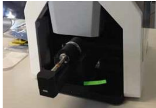
PH-5000 Interferometer microscope: example of coherence scanning interferometry technology

Coherence scanning interferometry (CSI), also called vertical scanning interferometry or scanning white light interferometry, measures changes in interference signal strength as the surface or instrument is scanned in the z direction. Basically, the technique assumes that each point on a surface is a mirror and finds the point by shining coherent light at the surface and looking at the resulting constructive interference patterns. (The interference signal results from combining the light reflected from the surface under examination with light reflected from a smooth reference surface.) Interferometric microscopes have smaller working distances and may not adequately image steep slopes on a surface. Bruker Corporation, Leica, Pyramidal Technologies, Sensofar LLC, Taylor Hobson, and Zygo Corporation produce microscopes that are based on interferometry and may be suitable for forensic applications.