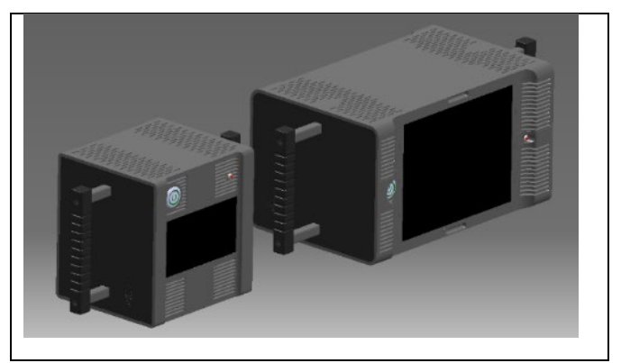
Exhibit 3. Scanner size comparison. The image shows the current model (right) and new prototype iteration (left).

resolution mode, the camera's field of view is 7.9" \times 14.0" at 140 dots per inch (dpi).<sup>6</sup> In high-resolution mode, the camera's field of view is 2.3" \times 4.0" at 400 dpi. The time of capture for scans in high resolution takes slightly longer than low resolution; however, the time difference is negligible. Scanned images are captured as raw data .xyzm files to minimize storage space and are downloaded from the scanner via an external USB drive.