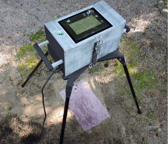
Exhibit 2 . 3D scanner set-up to capture a footwear impression in soil.

option would be preferable, but some were willing to consider purchasing the scanner without it.