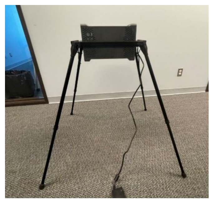
Exhibit 4. Side view of new tripod design.