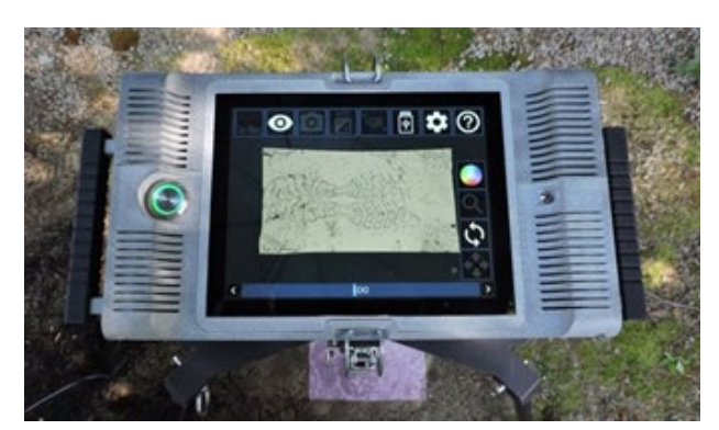
Exhibit 5. Overhead view of touchscreen interface with footwear scan on screen.